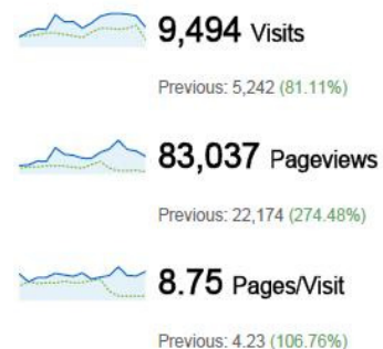
Analytics report showing drastic increase in site visits after alumni site was launched